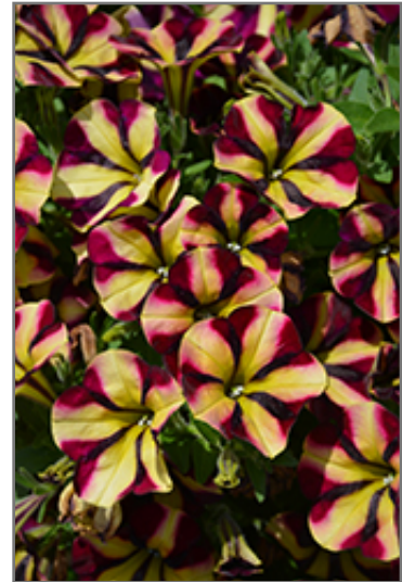
Amore Fiesta Petunia flowers

Amore Fiesta Petunia is recommended for the following landscape applications;