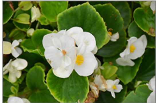
Topspin White Begonia flowers

Topspin White Begonia is recommended for the following landscape applications;