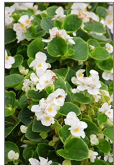
Topspin White Begonia in bloom