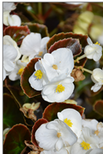
Senator IQ White flowers

Senator IQ White is recommended for the following landscape applications;