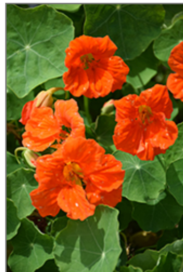
Glorious Gleam Nasturtium flowers

This stunning variety features large edible gold and orange blooms; this trailing plant should be encouraged to climb by tying; perfect for hanging baskets, patio containers or in gardens; the flowers peppery taste make it the perfect addition to salads