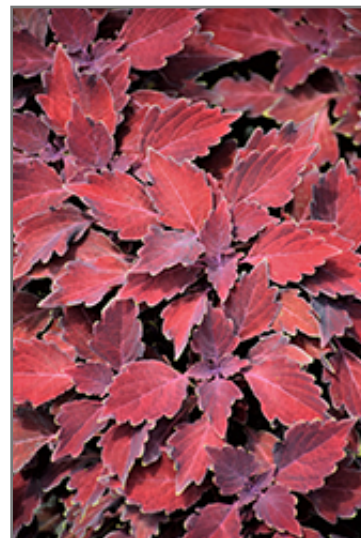
ColorBlaze Royale Cherry Brandy Coleus foliage

ColorBlaze Royale Cherry Brandy Coleus is recommended for the following landscape applications;