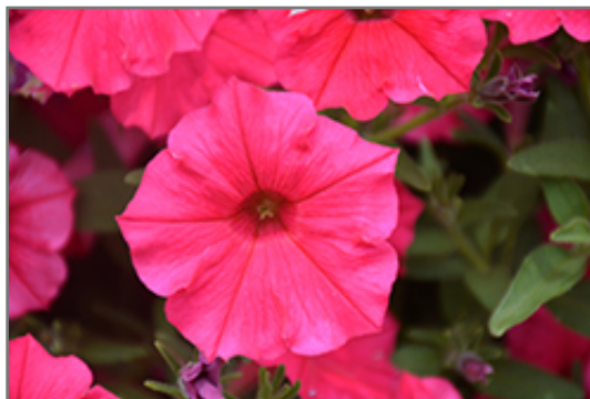
Supertunia Vista Paradise Petunia flowers

Supertunia Vista Paradise Petunia is recommended for the following landscape applications;