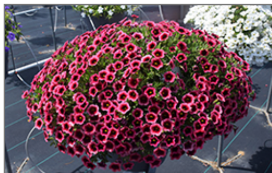
Superbells Watermelon Punch Calibrachoa in bloom