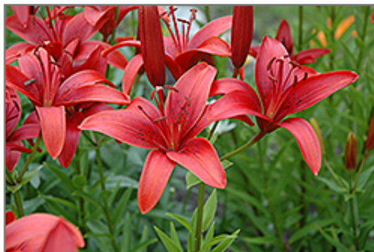
Red Duchess Lily flowers