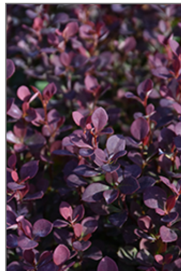
Sunjoy Todo Japanese Barberry foliage

Sunjoy Todo Japanese Barberry is recommended for the following landscape applications;