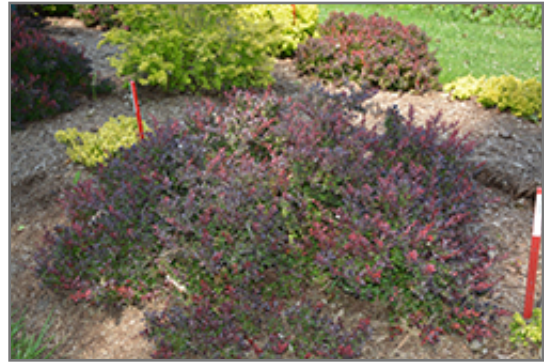
Sunjoy Todo Japanese Barberry

This plant is not reliably hardy in our region, and certain restrictions may apply; contact the store for more information.