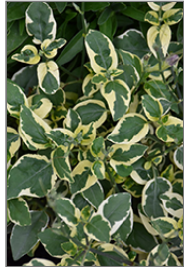
Variegated Chinese Violet foliage

A sprawling tender perennial or sub-shrub producing oval to heart shaped green leaves variegated with pale yellow to white; funnel shaped flowers appear, opening yellow or white, becoming flushed with violet tones; a good groundcover or container plant