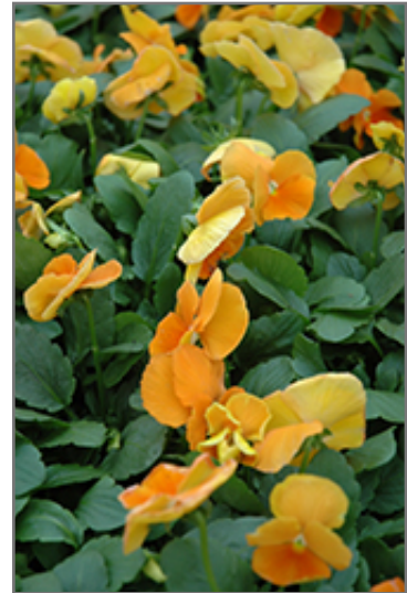
Matrix Orange Pansy flowers