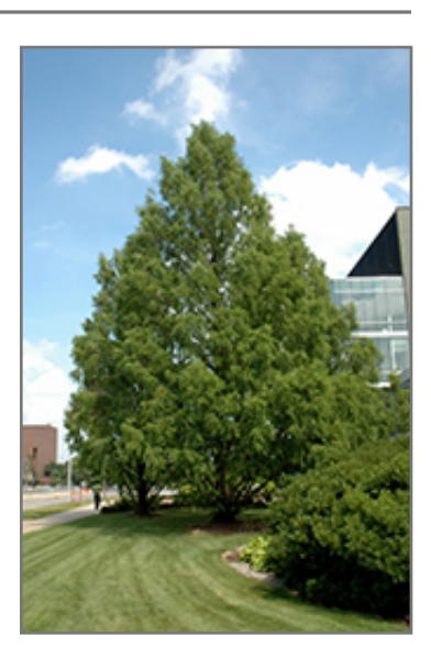
Dawn Redwood