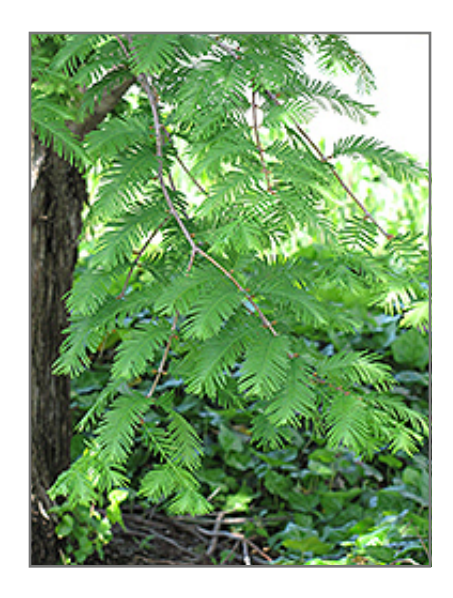
Dawn Redwood foliage