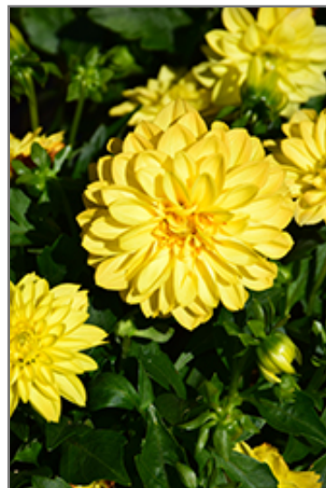
Dalaya Yellow 18 Dahlia flowers