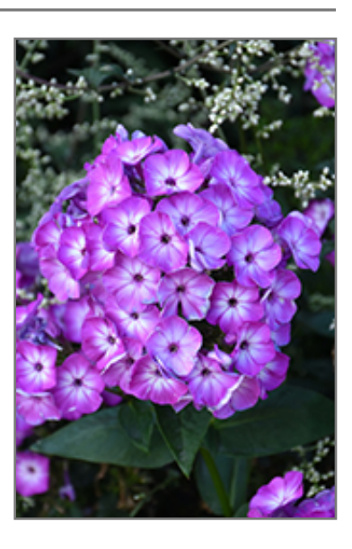
Volcano Purple with White Eye Garden Phlox flowers