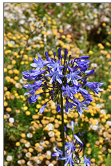
Blue Leap Agapanthus flowers