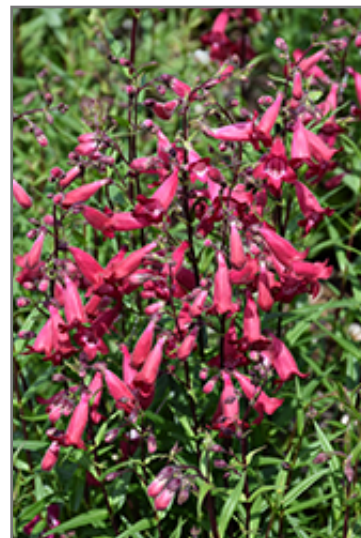
MissionBells Deep Rose Beard Tongue flowers