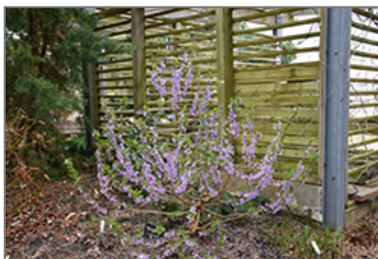
Lilac Daphne in bloom