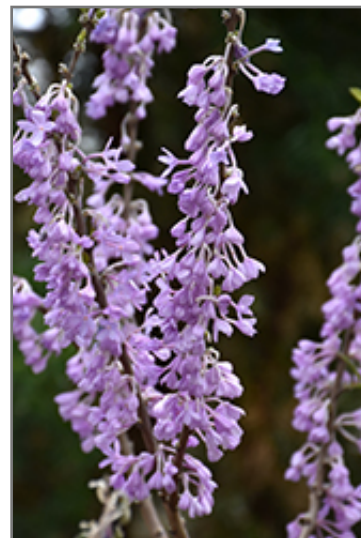
Lilac Daphne flowers