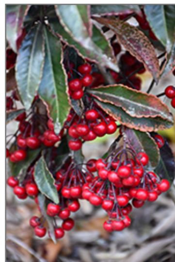
Red Hot Embers Coral Berry fruit