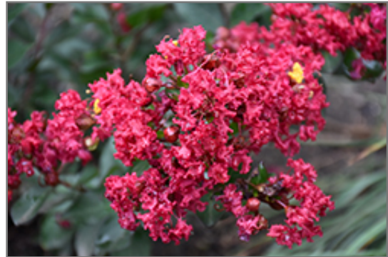
Barista Lava Java Crapemyrtle flowers

Barista Lava Java Crapemyrtle is recommended for the following landscape applications;