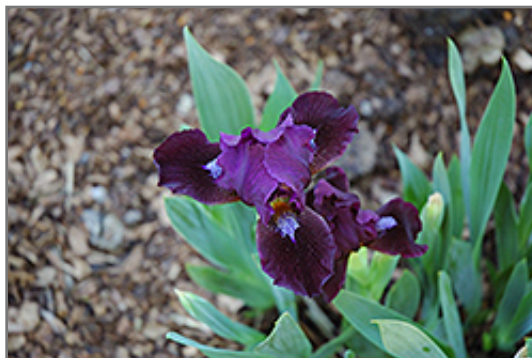
Dark Vader Iris flowers