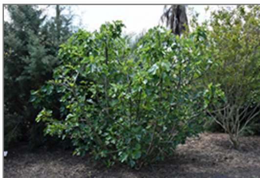
Ischia Fig

This is a multi-stemmed deciduous shrub with an upright spreading habit of growth. Its average texture blends into the landscape, but can be balanced by one or two finer or coarser trees or shrubs for an effective composition. This plant will require occasional maintenance and upkeep, and is best pruned in late winter once the threat of extreme cold has passed. It is a good choice for attracting birds to your yard, but is not particularly attractive to deer who tend to leave it alone in favor of tastier treats. It has no significant negative characteristics.