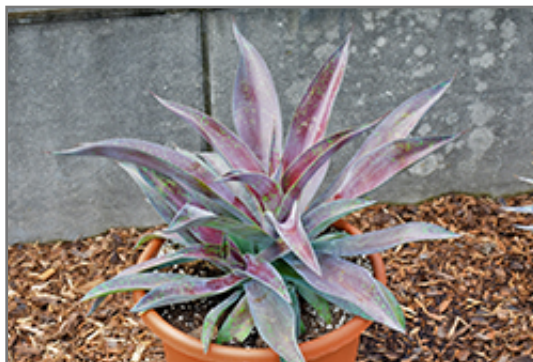
Mission to Mars Mangave

Mission to Mars Mangave will grow to be about 10 inches tall at maturity, with a spread of 22 inches. It grows at a fast rate, and under ideal conditions can be expected to live for approximately 5 years. As an herbaceous perennial, this plant will usually die back to the crown each winter, and will regrow from the base each spring. Be careful not to disturb the crown in late winter when it may not be readily seen!