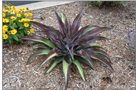
Mission to Mars Mangave

Mission to Mars Mangave is recommended for the following landscape applications;