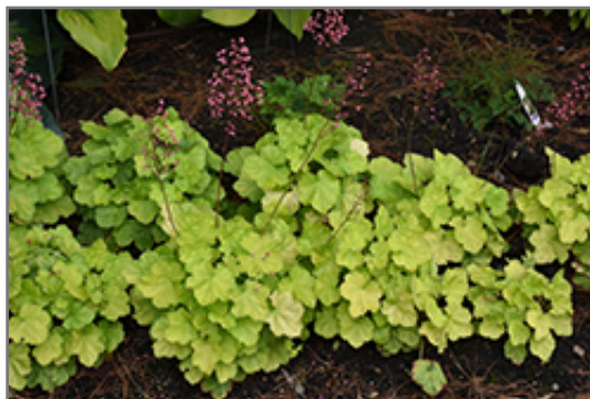
Primo Pretty Pistachio Coral Bells

Primo Pretty Pistachio Coral Bells will grow to be about 10 inches tall at maturity extending to 22 inches tall with the flowers, with a spread of 28 inches. When grown in masses or used as a bedding plant, individual plants should be spaced approximately 26 inches apart. Its foliage tends to remain low and dense right to the ground. It grows at a medium rate, and under ideal conditions can be expected to live for approximately 10 years. As an evergreen perennial, this plant will typically keep its form and foliage year-round.