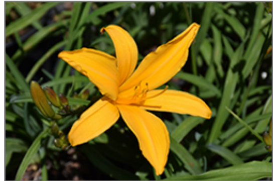
Aztec Gold Daylily flowers

Aztec Gold Daylily will grow to be about 20 inches tall at maturity, with a spread of 24 inches. When grown in masses or used as a bedding plant, individual plants should be spaced approximately 18 inches apart. It grows at a medium rate, and under ideal conditions can be expected to live for approximately 10 years. As an herbaceous perennial, this plant will usually die back to the crown each winter, and will regrow from the base each spring. Be careful not to disturb the crown in late winter when it may not be readily seen!