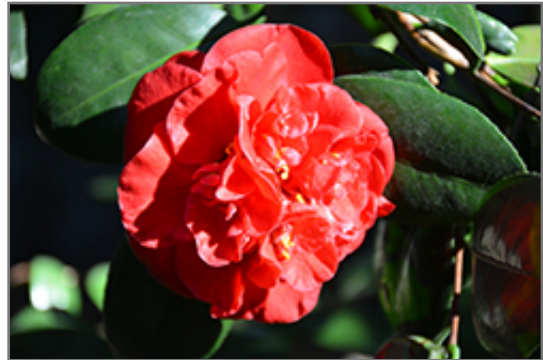
Dixie Knight Camellia flowers