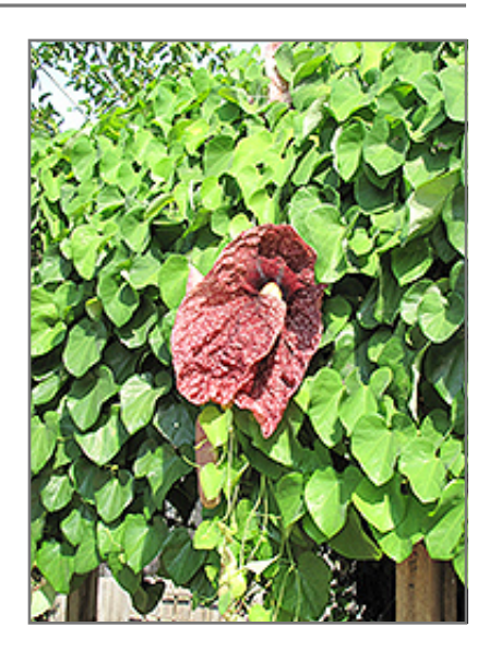
Giant Dutchman's Pipe flowers

This woody vine will require occasional maintenance and upkeep, and is best pruned in late winter once the threat of extreme cold has passed. It has no significant negative characteristics.