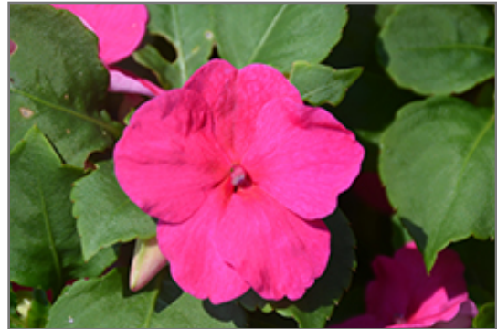
Accent Premium Rose Impatiens flowers