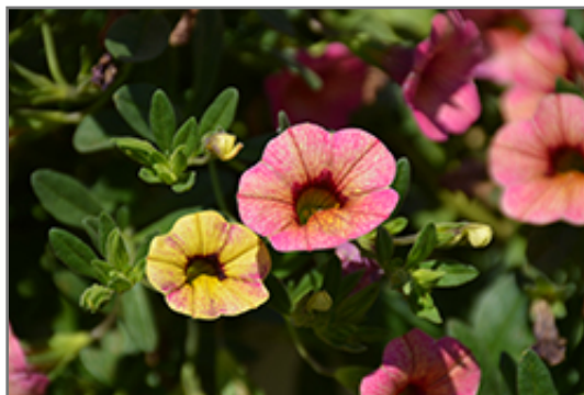
Chameleon Melon Berry Calibrachoa flowers

Chameleon Melon Berry Calibrachoa is recommended for the following landscape applications;