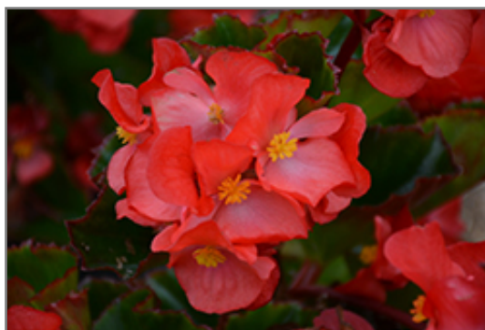
Megawatt Red Green Leaf Begonia flowers