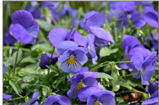
Cool Wave Blue Skies Pansy flowers