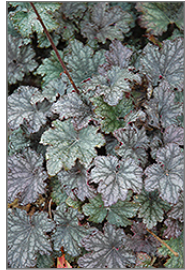
Frosted Violet Coral Bells foliage

Frosted Violet Coral Bells is recommended for the following landscape applications;