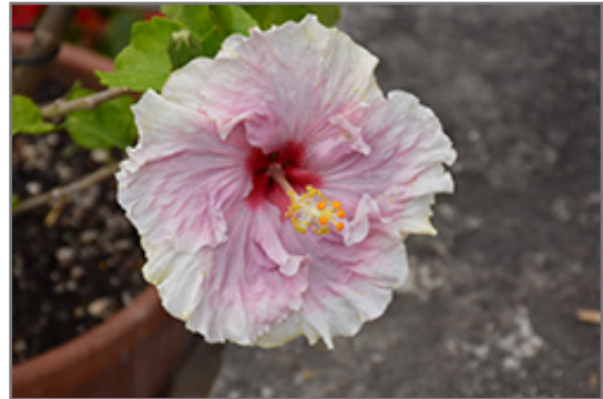
C'est Bon Cajun Hibiscus flowers

C'est Bon Cajun Hibiscus is a fine choice for the garden, but it is also a good selection for planting in outdoor pots and containers. With its upright habit of growth, it is best suited for use as a 'thriller' in the 'spiller-thriller-filler' container combination; plant it near the center of the pot, surrounded by smaller plants and those that spill over the edges. It is even sizeable enough that it can be grown alone in a suitable container. Note that when growing plants in outdoor containers and baskets, they may require more frequent waterings than they would in the yard or garden. Be aware that in our climate, most plants cannot be expected to survive the winter if left in containers outdoors, and this plant is no exception. Contact our experts for more information on how to protect it over the winter months.