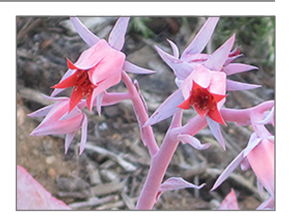
Afterglow Echeveria flowers

Afterglow Echeveria will grow to be about 14 inches tall at maturity extending to 24 inches tall with the flowers, with a spread of 24 inches. Its foliage tends to remain dense right to the ground, not requiring facer plants in front. It grows at a medium rate, and under ideal conditions can be expected to live for approximately 20 years. As an evegreen perennial, this plant will typically keep its form and foliage year-round.