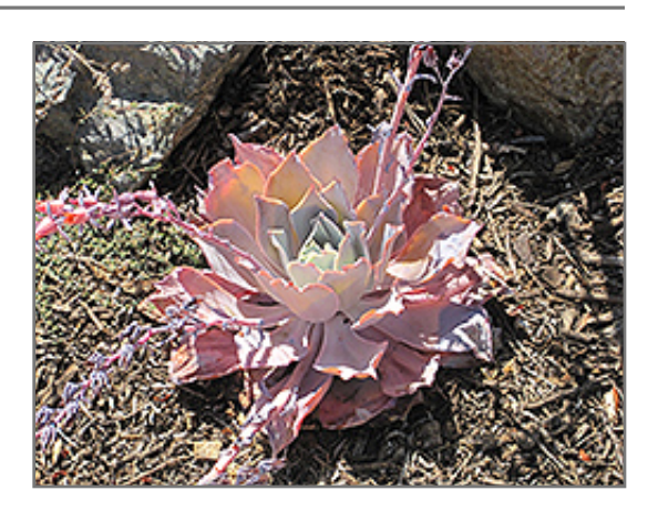
Afterglow Echeveria