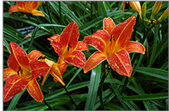
Orange Balls Daylily flowers