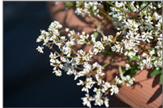
Bling White Princess Euphorbia flowers