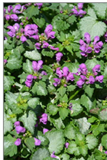
Purple Chablis Spotted Dead Nettle flowers