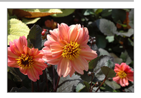
Dahlightful Georgia Peach Dahlia flowers

This exceptional variety will produce masses of lovely apricot-peach flowers with golden centers from early summer until mid-fall; contrasting foliage is dark green-purple; a perfect addition to borders or containers