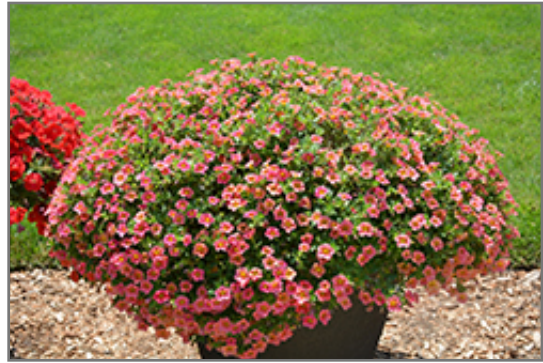
Superbells Tropical Sunrise Calibrachoa in bloom

Superbells Tropical Sunrise Calibrachoa will grow to be about 10 inches tall at maturity, with a spread of 24 inches. When grown in masses or used as a bedding plant, individual plants should be spaced approximately 12 inches apart. Its foliage tends to remain low and dense right to the ground. This fast-growing annual will normally live for one full growing season, needing replacement the following year.