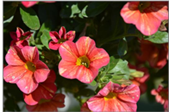
Superbells Tropical Sunrise Calibrachoa flowers

This plant will require occasional maintenance and upkeep. Trim off the flower heads after they fade and die to encourage more blooms late into the season. It is a good choice for attracting bees and hummingbirds to your yard, but is not particularly attractive to deer who tend to leave it alone in favor of tastier treats. It has no significant negative characteristics.