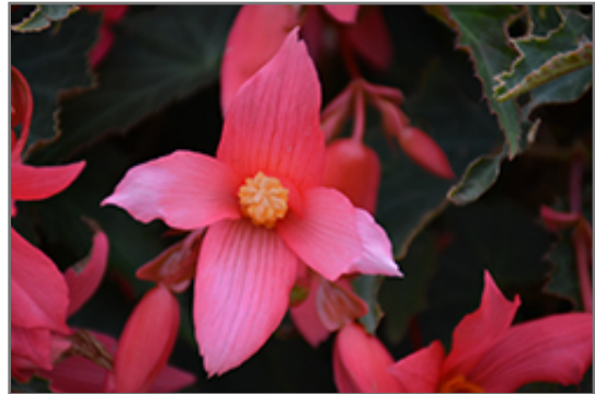
Bossa Nova Pink Glow Begonia flowers