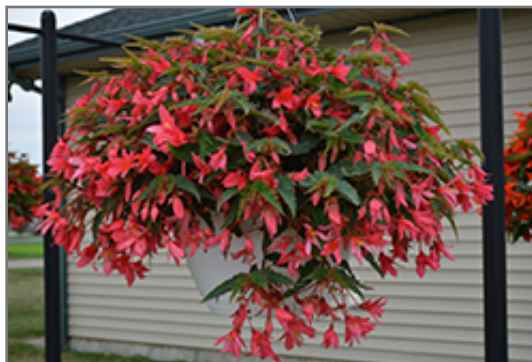
Bossa Nova Pink Glow Begonia in bloom

Bossa Nova Pink Glow Begonia is a fine choice for the garden, but it is also a good selection for planting in outdoor containers and hanging baskets. Because of its trailing habit of growth, it is ideally suited for use as a 'spiller' in the 'spiller-thriller-filler' container combination; plant it near the edges where it can spill gracefully over the pot. Note that when growing plants in outdoor containers and baskets, they may require more frequent waterings than they would in the yard or garden.