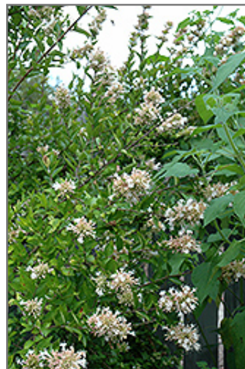
Chinese Abelia flowers