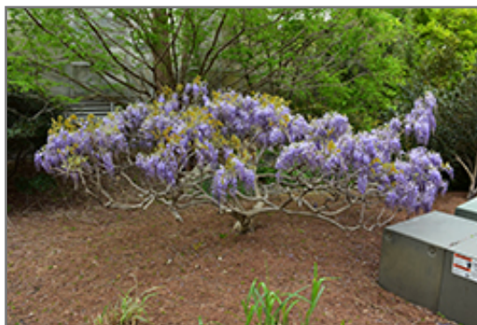
Japanese Wisteria in bloom