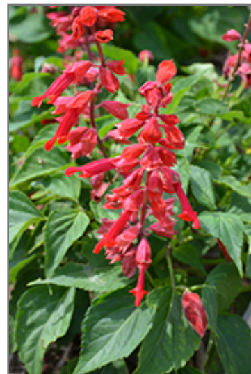
Saucy Red Salvia flowers

Saucy Red Salvia is recommended for the following landscape applications;