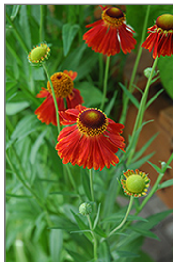
Moerheim Beauty Sneezeweed flowers

Moerheim Beauty Sneezeweed is recommended for the following landscape applications;