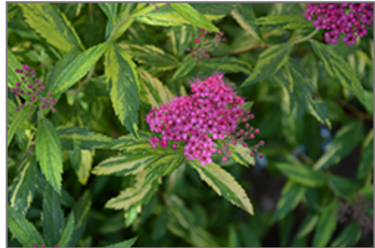
Double Play Painted Lady Spirea flowers