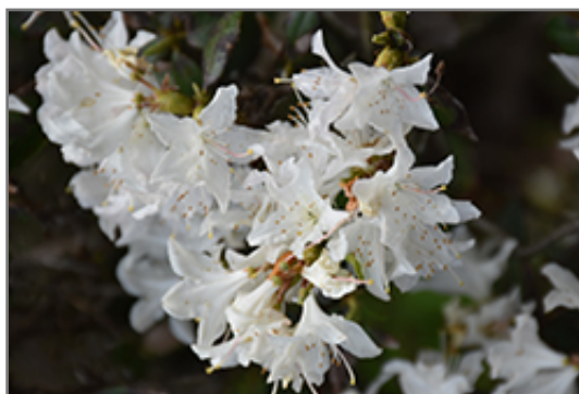
Yaku Fairy Dwarf Rhododendron flowers

Yaku Fairy Dwarf Rhododendron will grow to be about 12 inches tall at maturity, with a spread of 12 inches. It tends to be a little leggy, with a typical clearance of 1 foot from the ground. It grows at a slow rate, and under ideal conditions can be expected to live for 40 years or more.