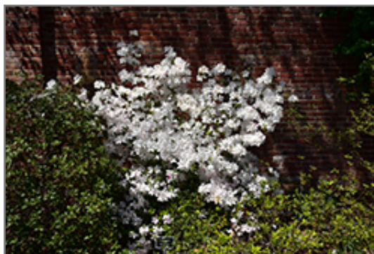
Festive Azalea in bloom