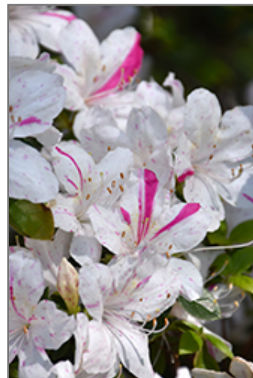
Festive Azalea flowers