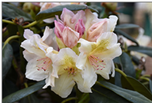
Arctic Gold Rhododendron flowers

Arctic Gold Rhododendron will grow to be about 4 feet tall at maturity, with a spread of 4 feet. It tends to be a little leggy, with a typical clearance of 1 foot from the ground. It grows at a slow rate, and under ideal conditions can be expected to live for 40 years or more.