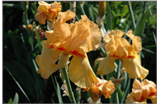
China Moon Iris flowers