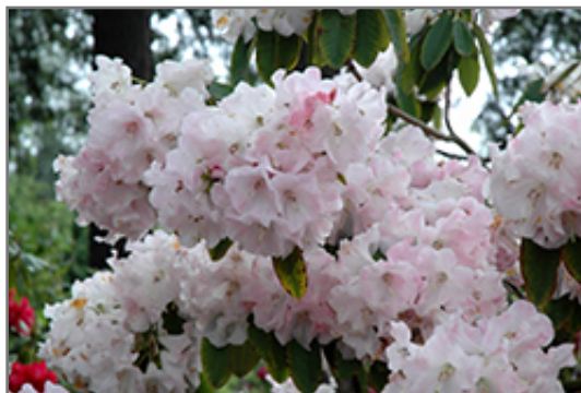
Pilgrim Rhododendron flowers

Pilgrim Rhododendron will grow to be about 7 feet tall at maturity, with a spread of 7 feet. It tends to be a little leggy, with a typical clearance of 1 foot from the ground, and is suitable for planting under power lines. It grows at a slow rate, and under ideal conditions can be expected to live for 40 years or more.