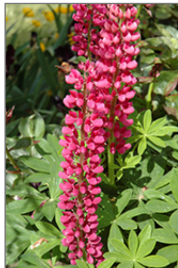
Minarette Red Lupine flowers

Minarette Red Lupine will grow to be about 16 inches tall at maturity, with a spread of 16 inches. When grown in masses or used as a bedding plant, individual plants should be spaced approximately 14 inches apart. It grows at a fast rate, and under ideal conditions can be expected to live for approximately 3 years. As an herbaceous perennial, this plant will usually die back to the crown each winter, and will regrow from the base each spring. Be careful not to disturb the crown in late winter when it may not be readily seen!